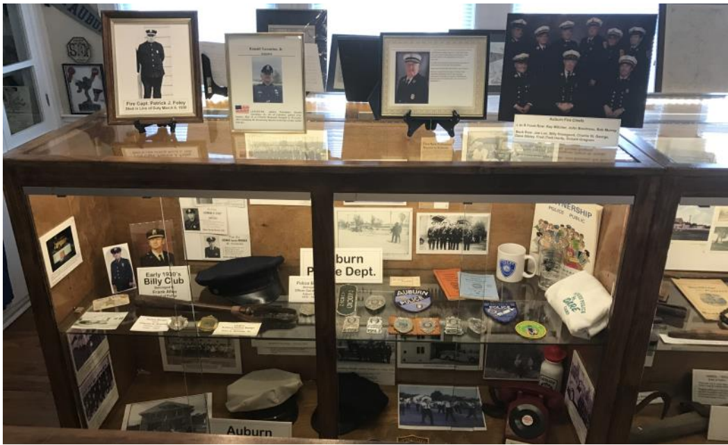
Redesigned Auburn Police and Auburn Fire exhibit with new LED lighting